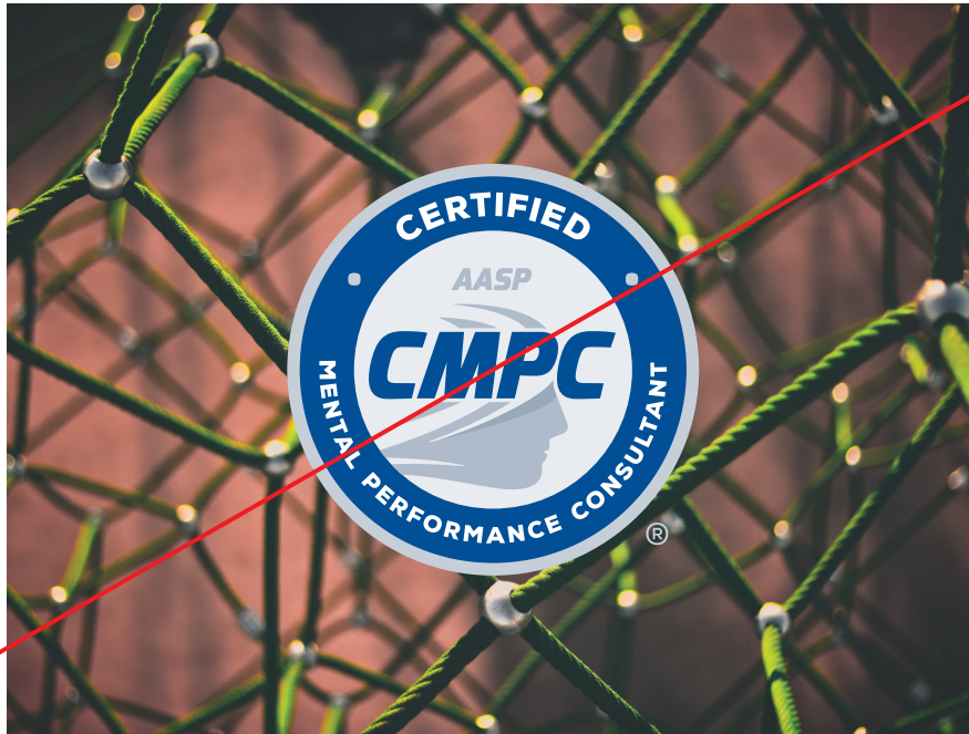
DO NOT display the logo over a complex or highly-detailed image