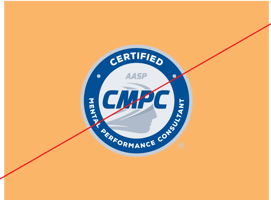
DO NOT display the logo over a color not found in the CMPC color palette or a background with insufficient contrast with the outer border and registration mark ®